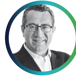
Antonio Pérez Mayor of Benidorm