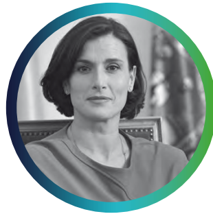
Gema Igual Mayor of Santander