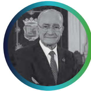
Francisco de la Torre Mayor of Málaga