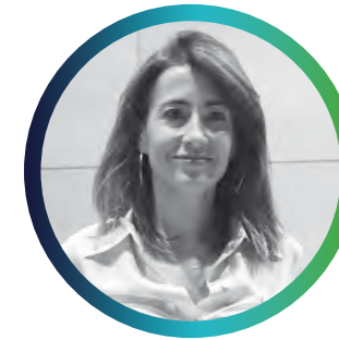
Raquel Sánchez Mayor of Gavà