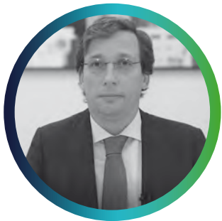
José Luis Martínez Almeida Mayor of Madrid