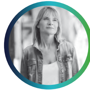
Lluïsa Moret Mayor of Sant Boi de Llobregat