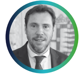
Óscar Puente Mayor of Valladolid